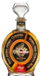
Extra Añejo 15 Años Page 36