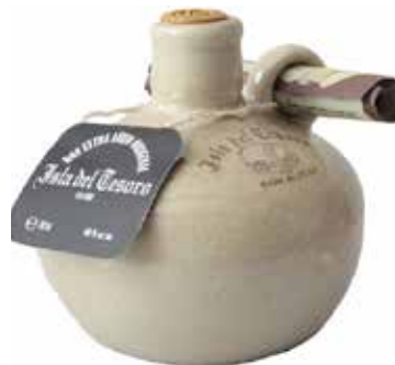
Isla del Tesoro Page 49