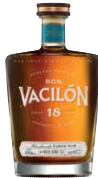
Reserva Especial 18 Años Page 22