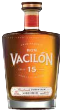
Gran Reserva 15 Años Page 22