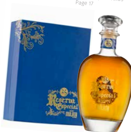
Reserva Especial Añejo 25 Años Page 17