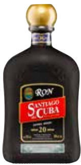
Extra Añejo 20 Años Page 43