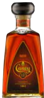
12 Años Page 32