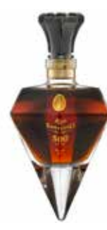
Santiago de Cuba 500 Page 46