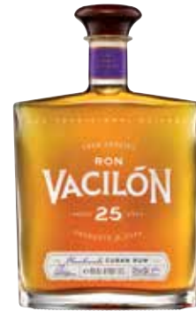
Gran Paraiso 25 Años Page 23