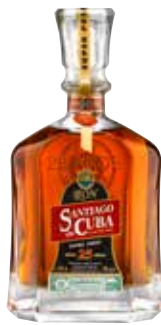
Extra Añejo 25 Años Page 43