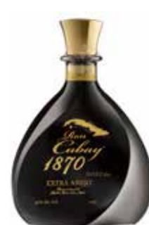
Extra Añejo 1870 Page 28