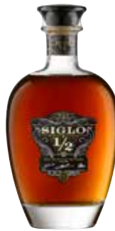
Siglo y 1/2 Page 44