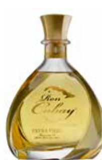
Carta Blanca Extra Añejo Page 28